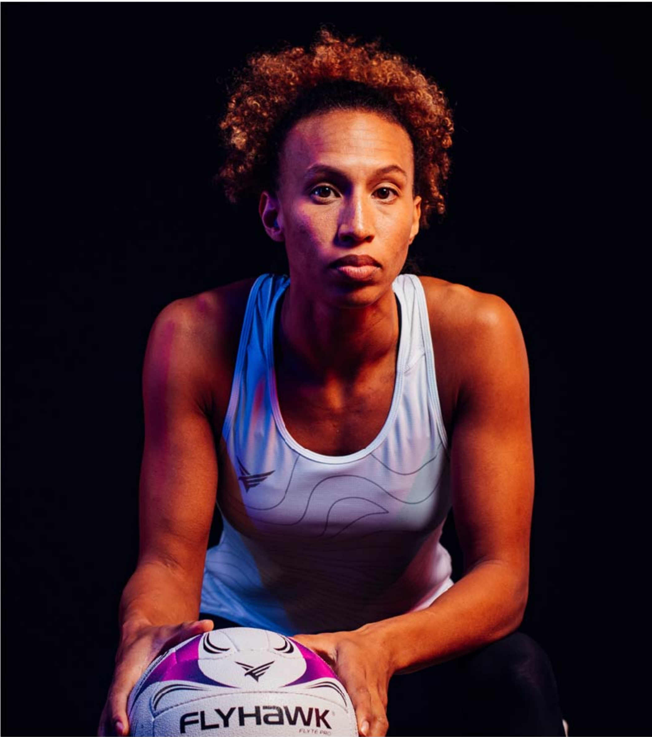
SERENA GUTHRIE MBE

They are also the players making history within netball and women’s sport inspiring and empowering others as they go.